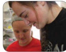
FC Interact Club Page 3